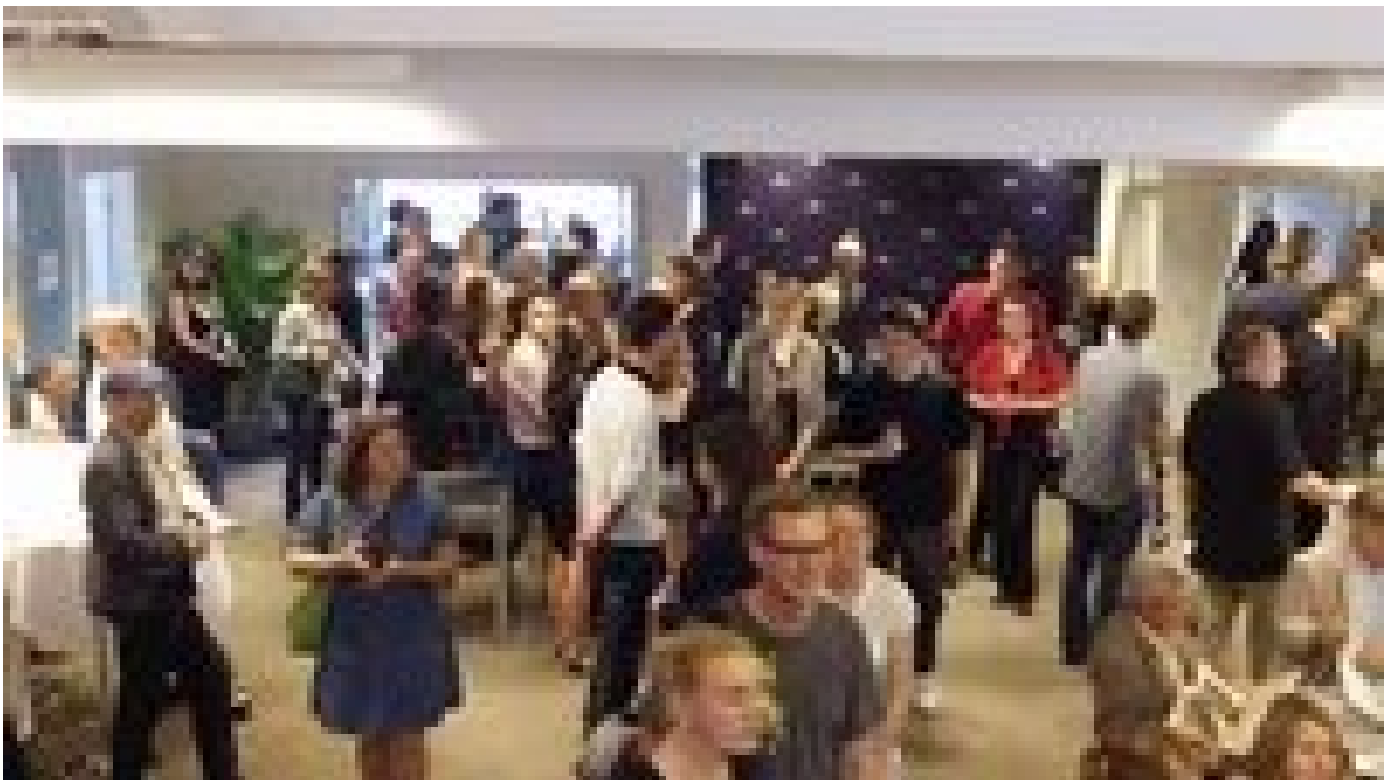
NPR FM Berlin 104,1 fans mingle at our special event.

We were also surprised by some other musicians who 'dropped by' to perform later in the evening after The New Prohibition Band wrapped up.