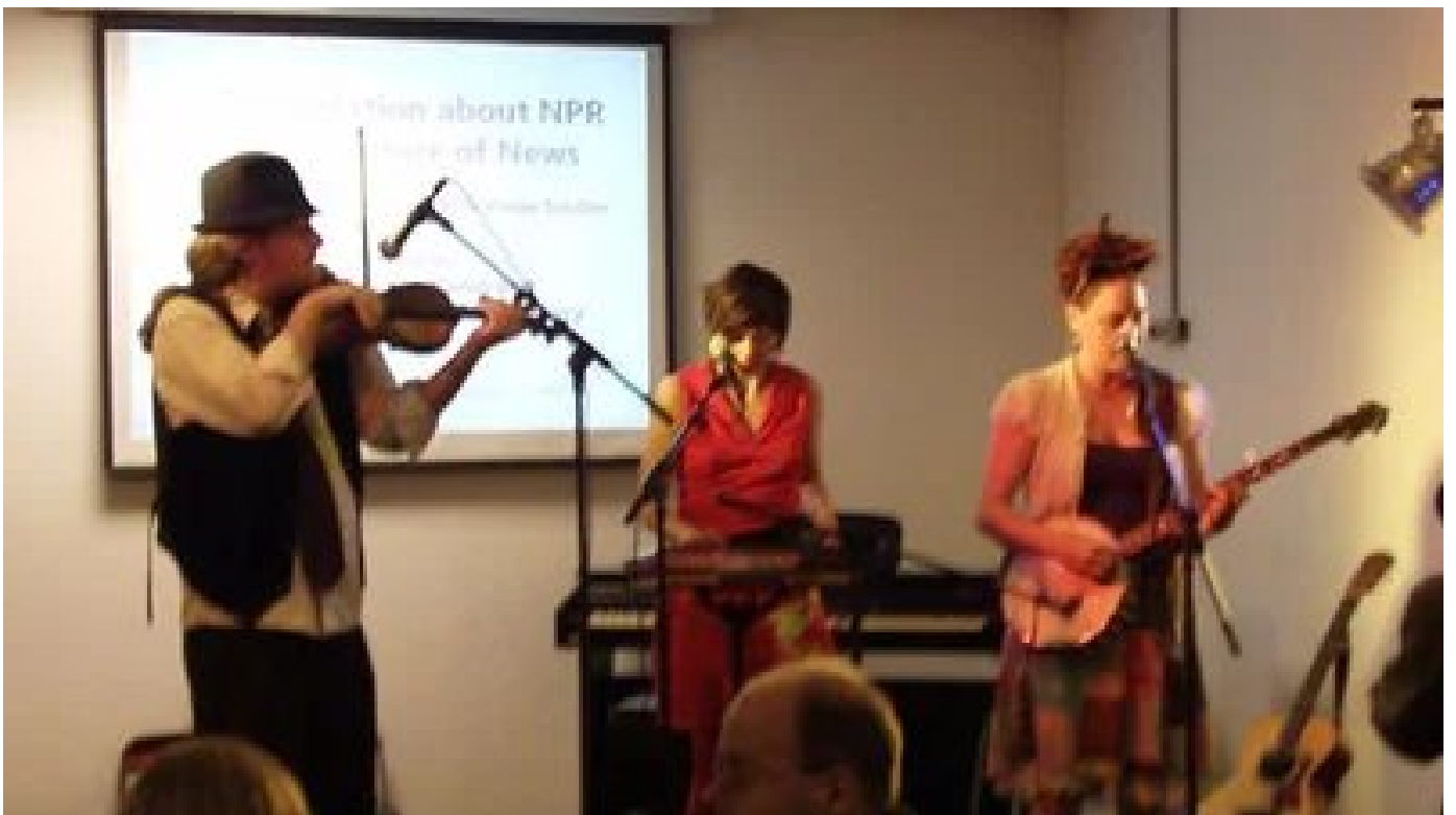
The New Prohibition Band NPR

Congratulations to our door prize winners of three brand new NPR Radios by Livio.